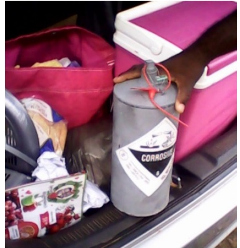
Mercury smuggled from South Africa to Zimbabwe in the trunk of a car.